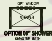
OPTION 80" SHOWER MASTER BATH