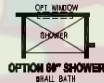
OPTION 80" SHOWER HALL BATH