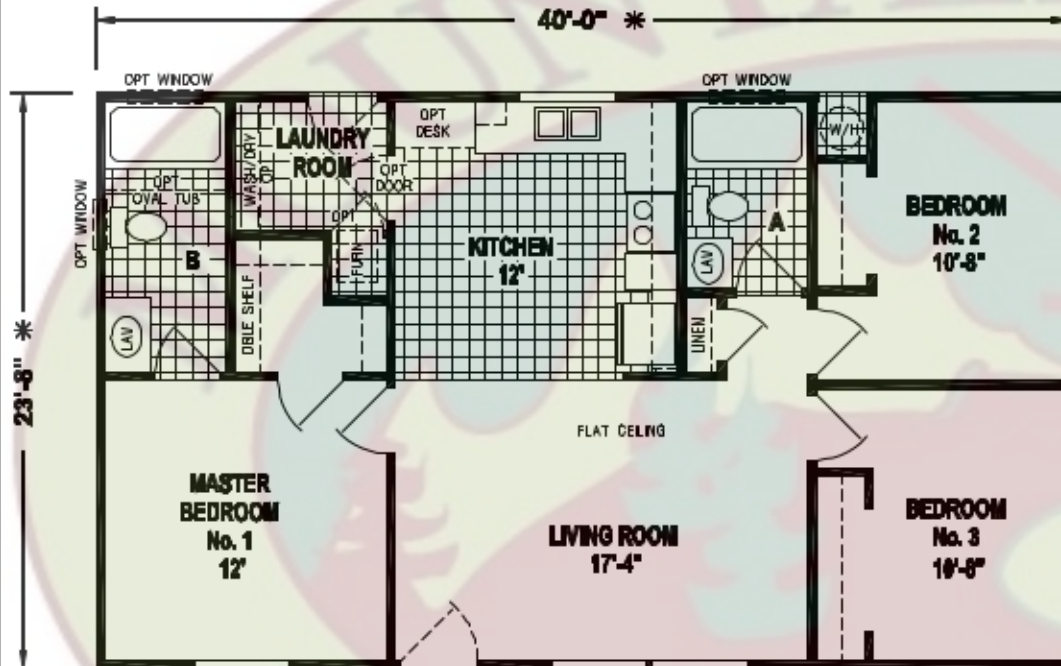
1100/4024 (946 SQ. FT.) 3BEDROOM - 2BATHS