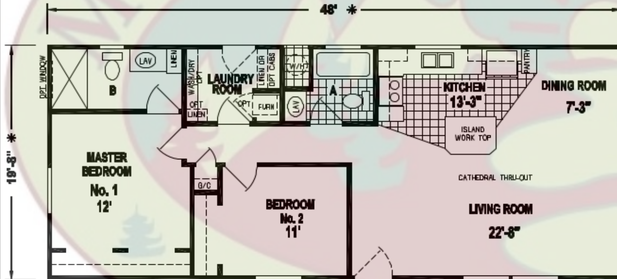
4204CT/4820 (943 SQ. FT.) 2BEDROOM - 2BATHS - CATHEDRAL THRU-OUT